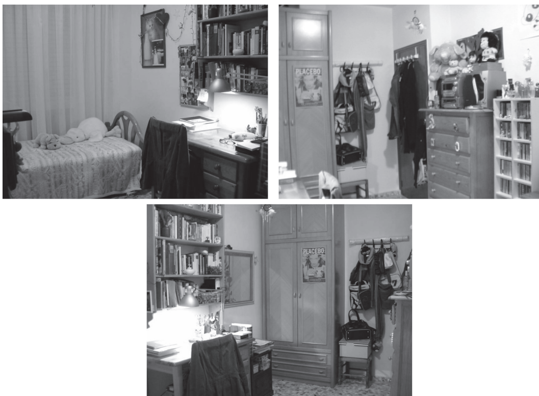
Figure 1. Joint presentation of the first female bedroom shown to participants

In order to choose the adjectives that best defined each resident, the frequency with which adjectives were selected for each room was calculated. The mean and the standard deviation of this percentage were calculated (see Table 1), and a criterion